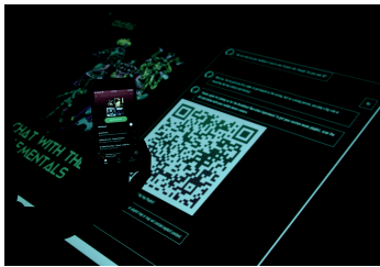
Figures 2 and 3: A [R]Evolution of Hip Hop Exhibit visitor interacts with the Breakbeat Narrative exhibit on a Surface Hub display; another visitor shows their custom playlist on their mobile device after scanning the QR code presented in the chatbot interface at the end of the experience.

process of five playlists (corresponding to each of the five labels) for each of the 11 narrative topics (resulting in 55 total playlists). The Hip Hop lyrical preferences survey prompts users to select which lyrics they prefer between five pairs of Hip Hop songs. The songs and lyrics used were curated subjectively using the descriptions of the three overall Breakbeat Narrative themes. The narrative cluster presented to the user is chosen at random from the theme in which they are determined to have the most interest. Using the musical preferences category the user is placed in ( Mellow , Danceable , Artsy , Intense , or Rootsy ) and the specific narrative they are assigned based on the result of their lyrical preferences survey (one of 11 narratives related to Fashion , Social Impacts , or Location ), the user is presented with a customized narrative and playlist experience following their completion of the surveys.